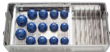
Biomet 32mm CoCr Bi-Polar Instrument Set