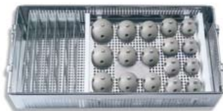
Biomet 28mm CoCr Bi-Polar Instrument Set